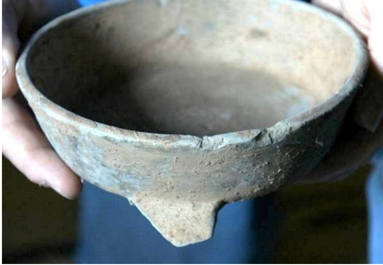
A 3-Legged Pot