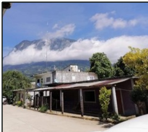
The city of Jalapa de Diaz in the foreground with Cerro Rabon as the backdrop. We believe that Mormon’s library is buried on the mountain.

What followed from our return home and subsequent meetings was