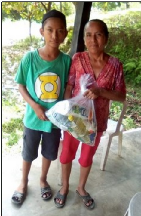
Packets of staple food items are received by residents of the area. Your donations are being put into action on a monthly basis.

We are anxious to return to the hill and to the people. As I mentioned at the beginning, our original intent was strictly an archaeological-type inves-